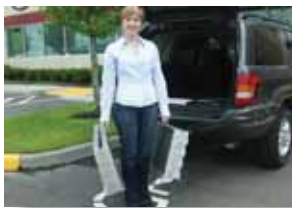
Separates for transport and storage