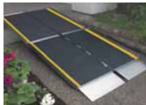
Bottom transition plates adjusts to uneven terrain

The TRIFOLD® Advantage Series® ramp, with its unique 3-fold design, offers the length required for wheelchairs and scooters to easily access steps, vehicles, and raised landings. The ramp is designed to be used and carried as one unit, or if desired, can be separated into two individual sections. By simply removing two hinge pins, the ramp quickly separates into two lightweight halves, each with their own handle. The patent pending hinge design features interlocking brackets to provide smoother operation and reduced pinch points. Ramp features an applied skid-resistant surface with reflective safety stripes, as well as self-adjusting bottom transition plates for easy conversion from ramp to ground. Manufactured of welded aircraft-grade aluminum.