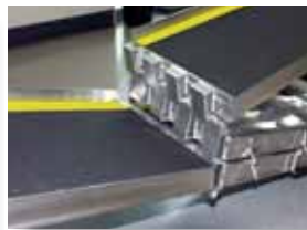
New hinge design