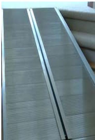
Features a no-pinch, non-protruding live hinge for safe, silent, and maintenance free operation.

Introducing the new SUITCASE® Signature Series™ ramp. While similar in appearance and function to the faithful SUITCASE Classic Series ramp, the Signature Series version features several innovative design enhancements. From the no pinch, non-protruding full-length live hinge and durable, ergonomically designed handles to the enhanced extruded tread for superior traction, this ramp was redesigned from the ground up to be simply the best in the industry. Top Lip Extension (TLE) compatible. Available in 2' – 8' lengths with an 800-pound weight capacity.