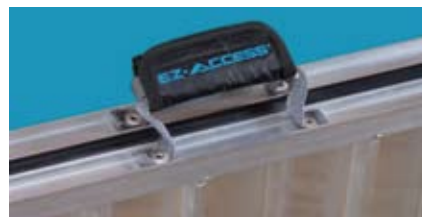
Flexible, non-breakable handles offer convenient carrying and a comfortable grip.